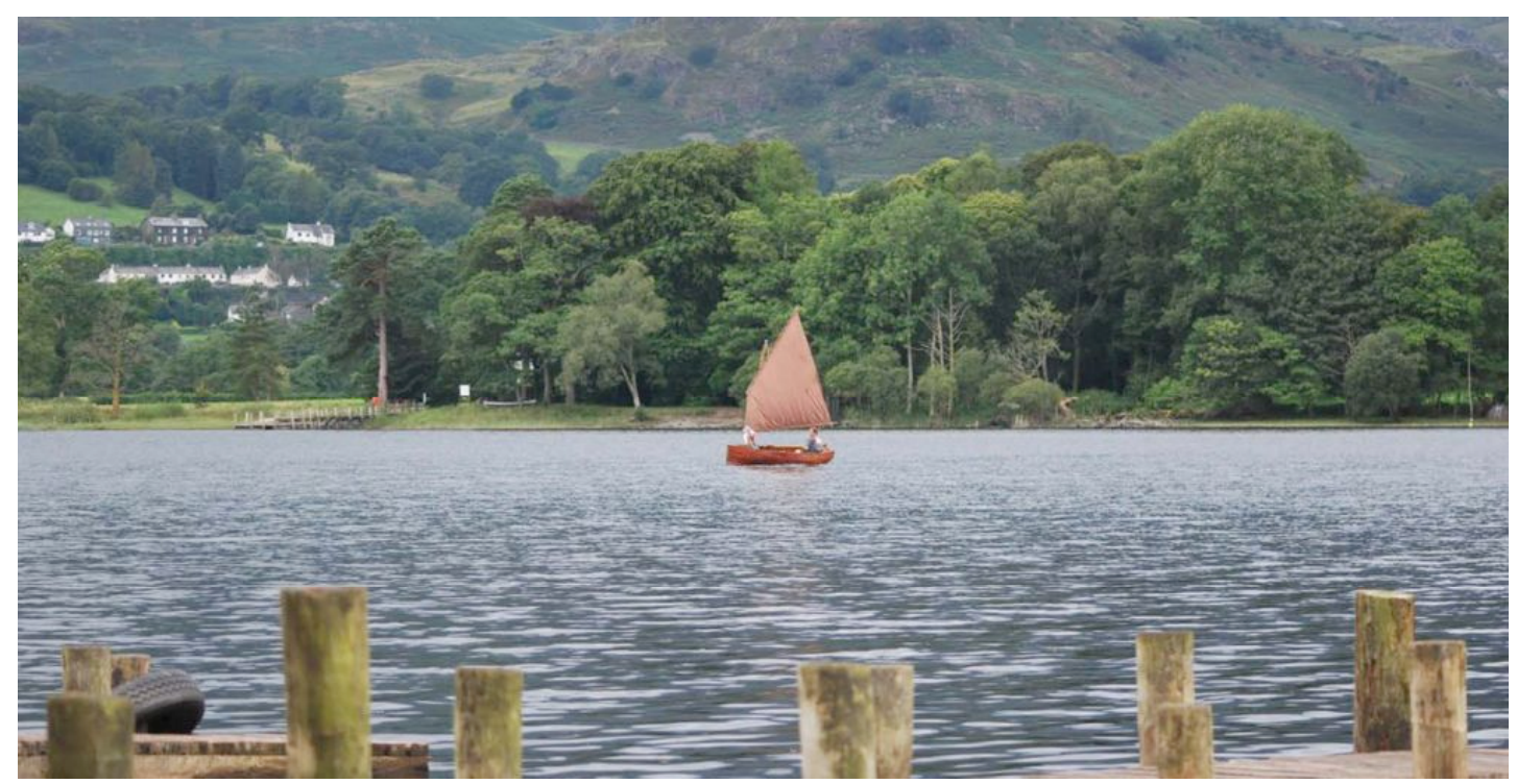
'Swallow' from the movie, at home on Coniston Water