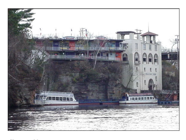
Shops and boat company

The raft men who moved logs down the river in the last century, called the scariest part of the river the Devil's Elbow. There, the river is stood on its side - 60 feet deep on the fathometer, and about forty feet wide. There is a sharp corner that must be really dangerous still in the summer with the big tour boats going through. The current is strong there too.